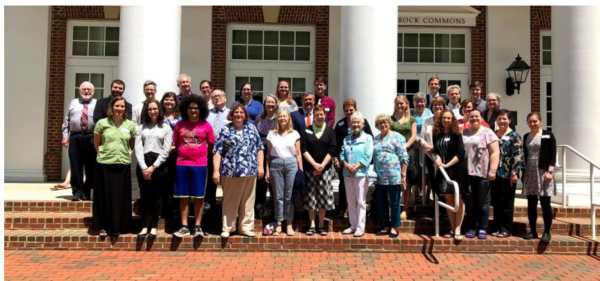
Classical Association of Virginia, May 2019 Randolph-Macon College

Each year, FLAVA gathers educators, administrators and scholars of Virginia's world language programs and supports their professional development needs and interests in teaching, technology, pedagogy, and learning. The conference for language educators is from October 3-5, 2019 at the DoubleTree by Hilton in Williamsburg, VA . Registration and further information can be found at https://flavaweb.org .