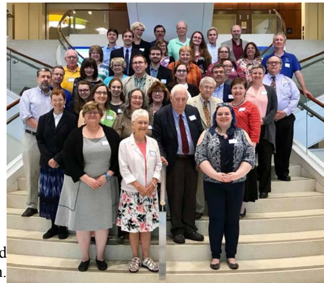
Attendees at the Spring Meeting hosted by the University of Mary Washington.