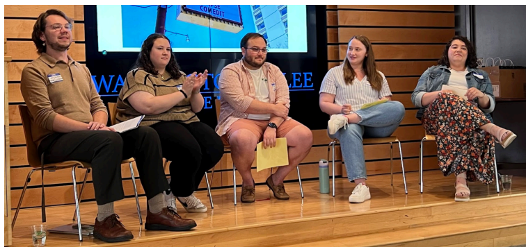
New Teachers Panel